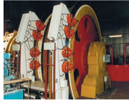
A new hydraulically controlled disc brake system was supplied by ABB to Alrosa, the Russian diamond mining company, for the revamping of a mine hoist in one of its diamond mines in Mirny in eastern Siberia.

In recent years, ABB has executed numerous projects for the modernization of mine hoists manufactured by ABB or others. They range from minor upgrades of single hoists to large revamps of complete hoisting plants such as that at LKAB's mine in Kiruna, Sweden, where a total of ten hoists with a combined capacity of 26.5 million tonnes per year were modernized.