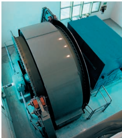
Friction hoist with pulley diameter of 4.5 m.