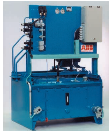
Hydraulic disc brake control unit.