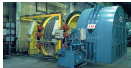
LKAB, Kiruna, Sweden. A total of ten hoists with a combined capacity of 26.5 million tonnes per year have been modernized.