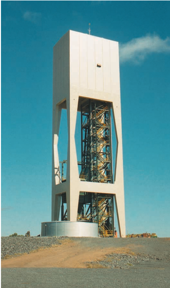
ABB Mine Hoist Systems