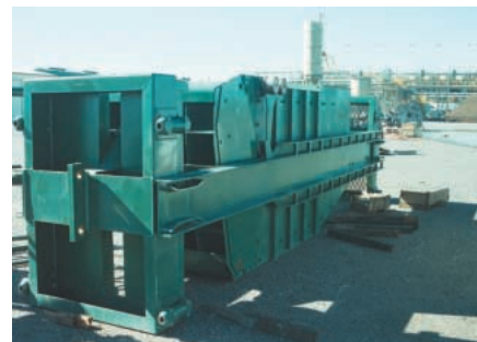
One of the two 13-tonne deadweight skips prior to installation at BHP Minerals' Cannington Mine, Australia.