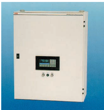
ABB's AHM 110 Advant Hoist Monitor provides very accurate monitoring of essential safety parameters.