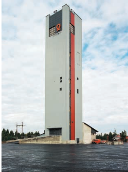
Pyhäsalmi head frame. ABB has delivered a complete package of mechanical and electrical equipment including the Drive IT ACS 6000SD synchronous motor drive.