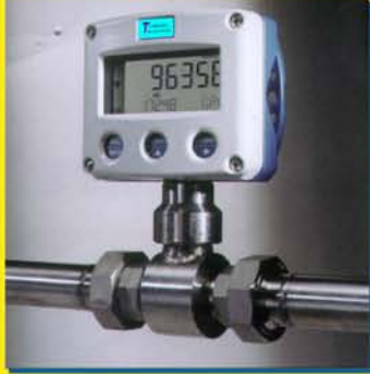
Direct mounting on flow meter