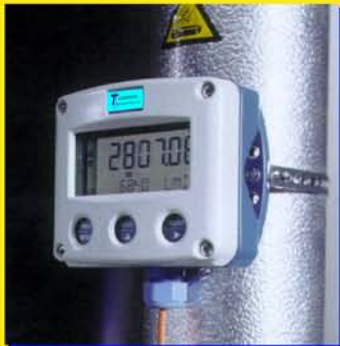
Pipeline mounting (vertical or horizontal)

...The new Turbines, Inc. FW series monitor is one of the most attractive, easy to use, rugged, durable and feature rich monitors on the market today.