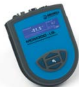
MDM300 I.S. Portable Dew-Point Hygrometer