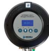
XTP601 Oxygen Analyzer