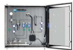
ES70 Sampling System

Michell Instruments Ltd, Rotronic Instruments Corp. 135 Engineers Road, Suite 150, Hauppauge NY 11788 Tel: 631 427 3898, Email: us.info@michell.com , Web: www.michell.com/us