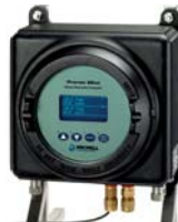
Promet EExd Process Moisture Analyzer