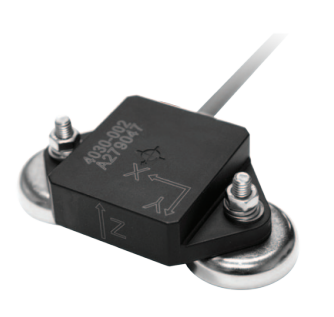
Accelerometer with magnetic mounting hardware included.