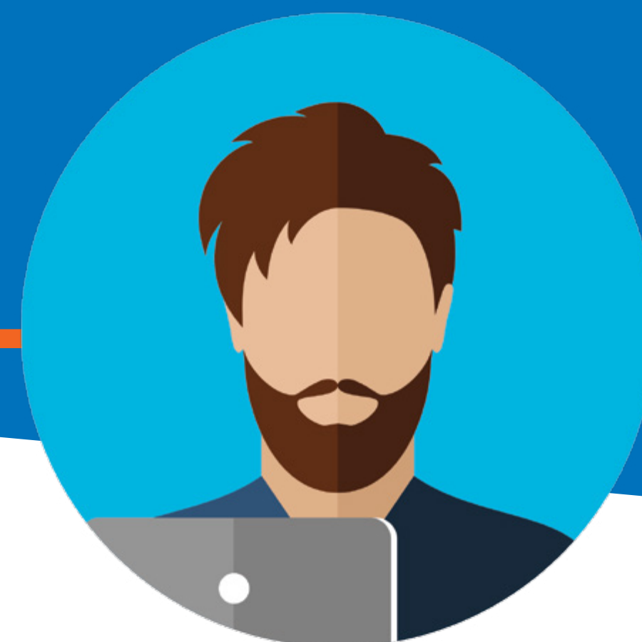
OEM & PANEL BUILDER